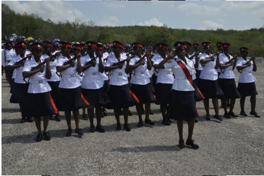
Female cadets march in the commencement.