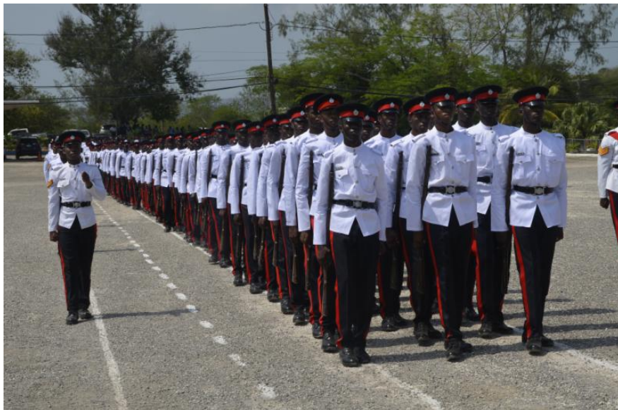
Male cadets line up to march in the commencement.

Website Donate to the NOBLE Scholarship Program Members Only Portal Directory