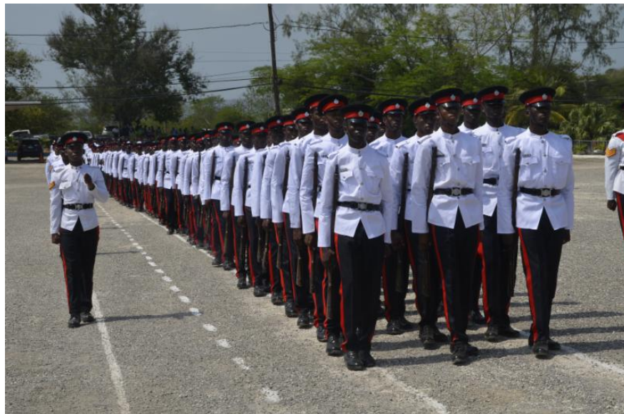
Male cadets line up to march in the commencement.

Website Donate to the NOBLE Scholarship Program Members Only Portal Directory